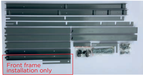
L shower front frame box